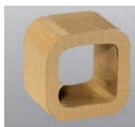
All AFM's feature 1/4" wall gauge wheel arms.